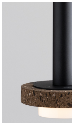
Ambra pendant black PV013C-ne

Download installation & care instructions on our website. Replacement parts are available through davidpompa directly. Lead times are subject to change. Variations in colour, texture, shape & size are natural characteristics of handmade products and should be expected.