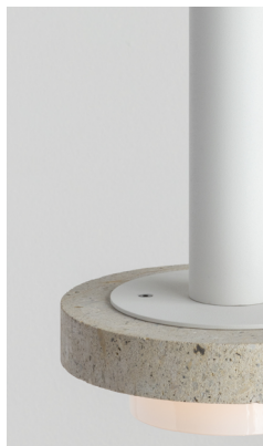
Ambra pendant white PV013C-bl