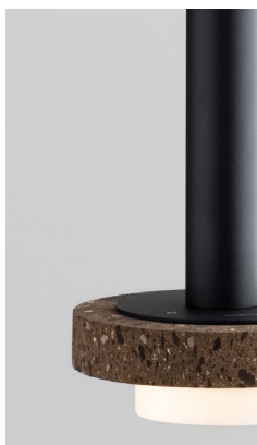
Ambra pendant black PV013C-ne