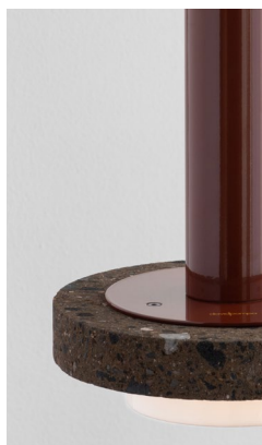
Ambra pendant red PV013C-rj