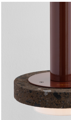
Ambra pendant red PV013C-rj