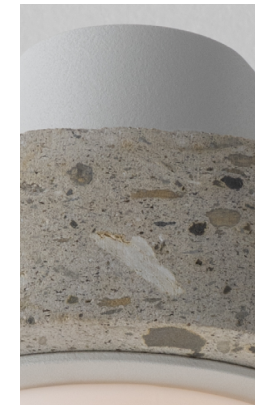
Ambra wall white PV002-bl